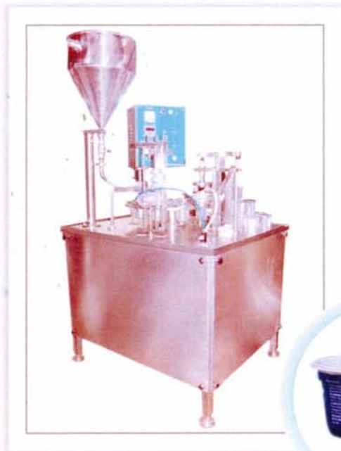
Cup Filling Sealing Machine