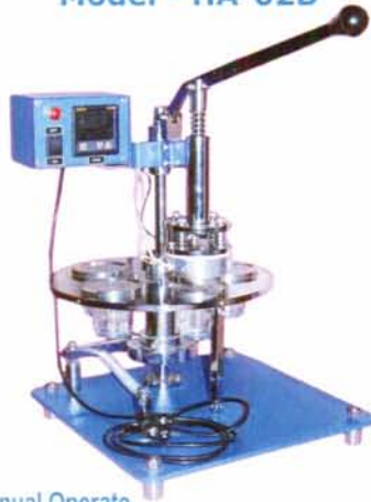
Manual Operate Cup Sealing Machine (rotary Type)