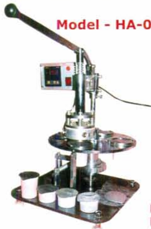
Model - HA-02C